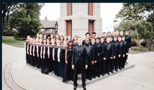
THE ROBERTS CHORALE