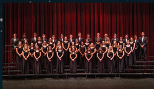
CHURCHVILLE-CHILI CONCERT CHOIR