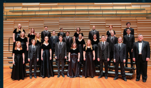
SUNY FREDONIA CHAMBER CHOIR