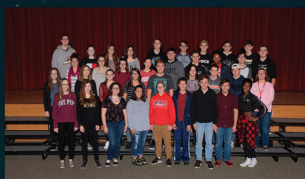
HILTON CONCERT CHOIR