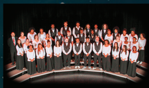
ROCHESTER CITY SCHOOL OF THE ARTS CONCERT CHOIR