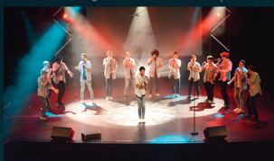
UNIVERSITY OF ROCHESTER MIDNIGHT RAMBLERS